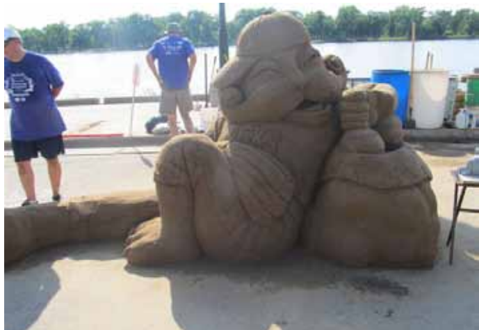
The award winning sculpture.